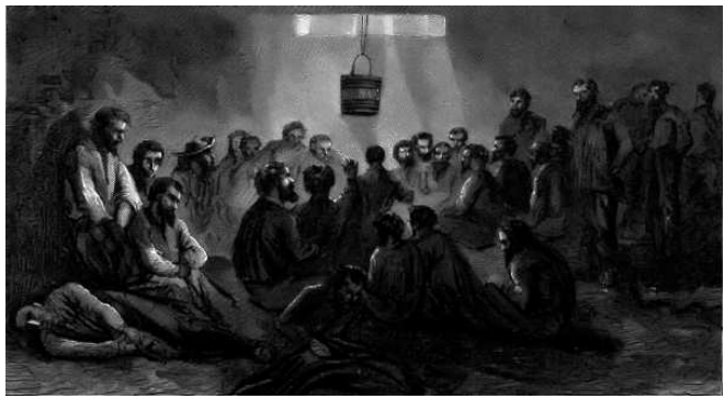
The Prison at Chattanooga

heat. In this their extremity they uncoupled two of the box cars, and left them to retard the pursuers. But the energetic pursuers pushed the cars before them to the first turn out, and were soon within four hundred yards of their victims. Only then our adventurers leaped from their car and took to the woods.