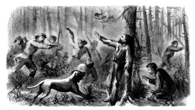
Capture of the Fugitives

his comrades, the designs of the expedition, and especially the name of the engineer who ran the train. But all the torment which their savage ingenuity could devise could not extort any confession from him. They only ceased their brutal work when they found that the task of subduing their victim was hopeless.