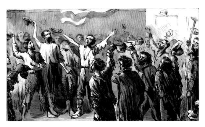
Under the Flag

they had been robbed were refunded, and a purse of a hundred dollars placed in each one's hand. They then received a furlough to visit their friends. Before they left Washington they were received by the President, who greeted them with his characteristic fatherly affection.